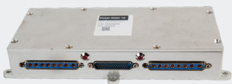
MC Power Rider 25A multi-channel power circuit breaker