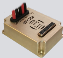
Rayon 120 35A game changer driver for common use