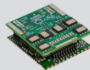
Micro Rayon Miniature motion control driver -15A