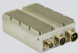
Rayon High Power Heavy duty driver up to 60A