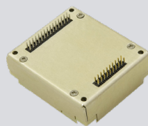
Rayon Slim Small and medium applications driver, 25A