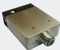
Single Power Rider 25A Smart, single, innovative Solid state circuit breaker