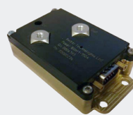
Single High Power Rider 150A / Power Rider 200A High current, smart, strong, Solid state circuit breaker