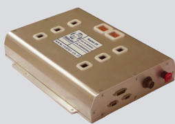
Rayon - EV dual 300A driver